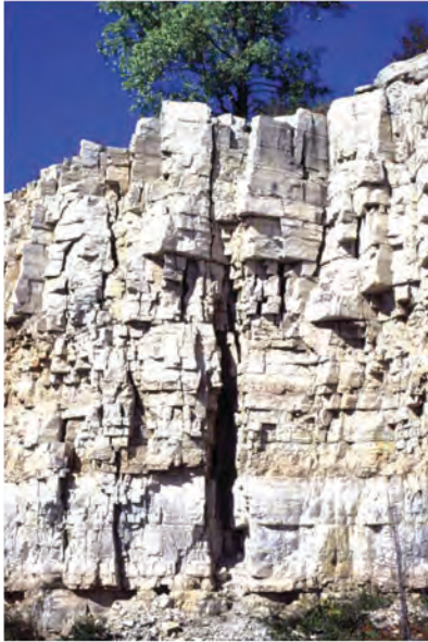
Fracturing and bedding in an exposure of carbonate bedrock near Sturgeon Bay in Door County.